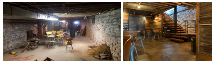
Broulik Building, Mount Vernon