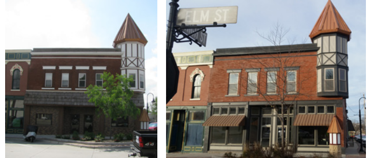
Bank Building, Avoca